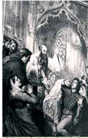
Painting depicting the miracle, Church of St. James, Louvain