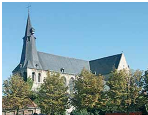
Church of St. James in Louvain