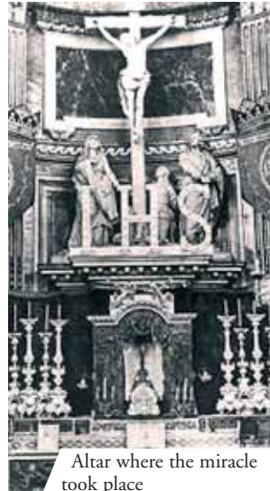
Altar where the miracle took place