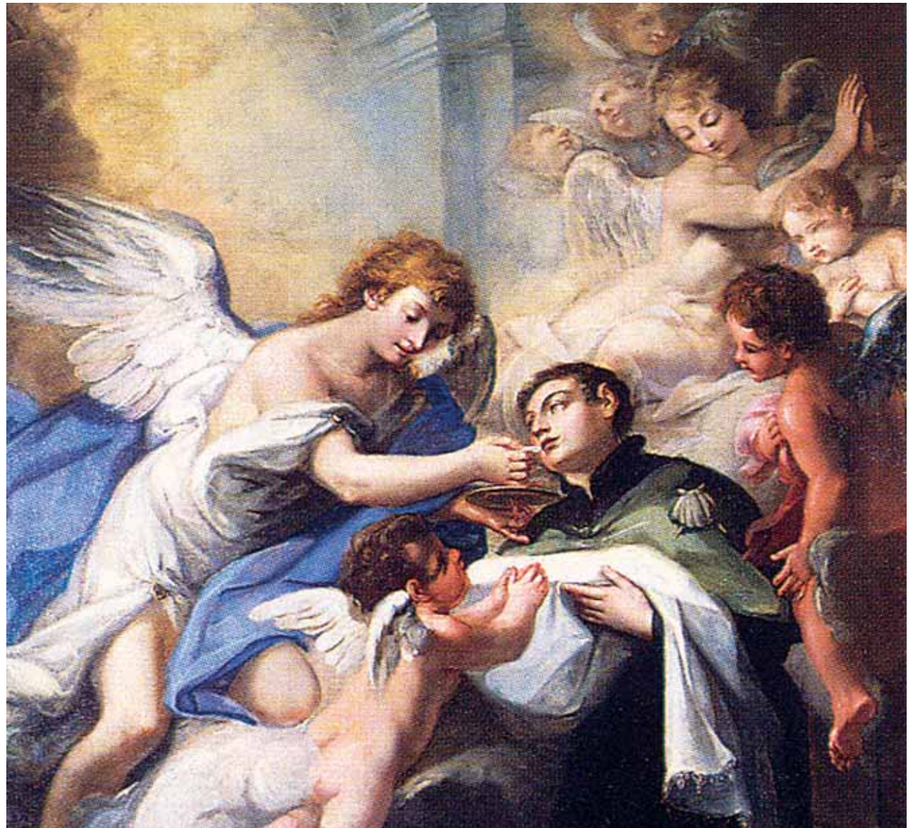
Saint Stanislaus receives Holy Communion from an Angel. Diocesan Museum of Milan

Saint Stanislaus Kostka, at the age of seventeen, was so gravely ill that he seemed very near the end of his life. In that time, he lived as the guest of a noble Protestant who would not even permit him to be visited by a Catholic priest. Stanislaus was not discouraged and one night, in the presence of his tutor, he received Communion in a miraculous way. A few days later he recovered and decided to enter the Jesuit order.