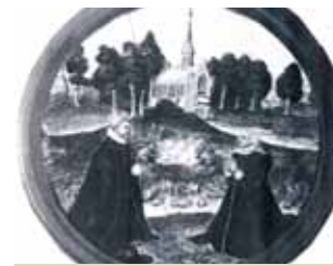
Painting of Van Ysendyck depicting the miracle