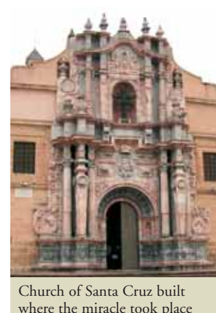
Church of Santa Cruz built where the miracle took place