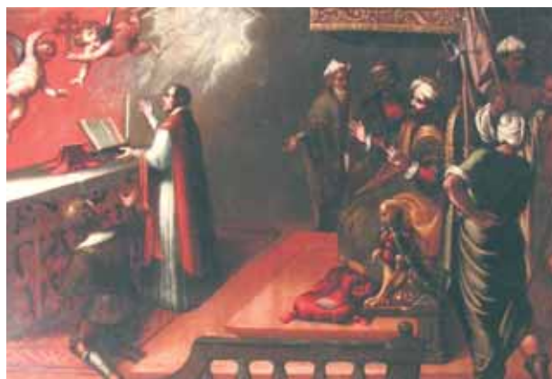
Ancient painting in the interior of the Church depicting the miracle