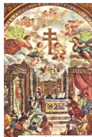
Fresco of the church