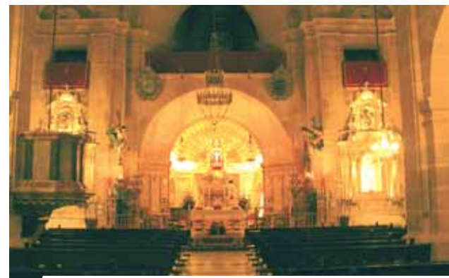
Interior of the Church of Santa Cruz