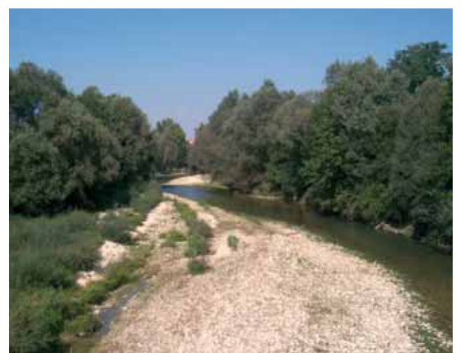
The Maira River

Canosio is a small village in the region of Val Maira, in the Diocese of Saluzzo. In 1630, its townspeople had grown cold in their religious observance due to the spread of the Calvinistic heresy. A day after the feast of Corpus Christi, the river at Maira flooded because of a torrential rainfall. The flood waters were so violent and powerful that some massive stones were dislodged from the mountain and threatened to destroy the valley and the village itself!