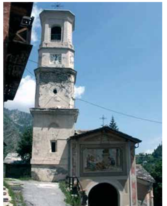
Parish Church of Canosio