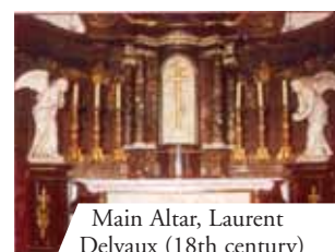
Main Altar, Laurent Delvaux (18th century)