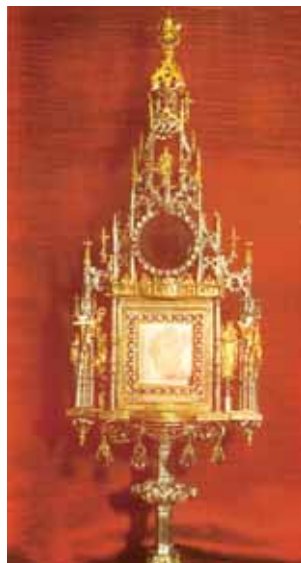
Reliquary of the Eucharistic miracle, corporal stained with Blood