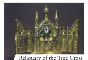
Reliquary of the True Cross