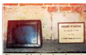
Picture of the altar where the curé of Haut-Ittre celebrated the Holy Mass where the miracle was verified