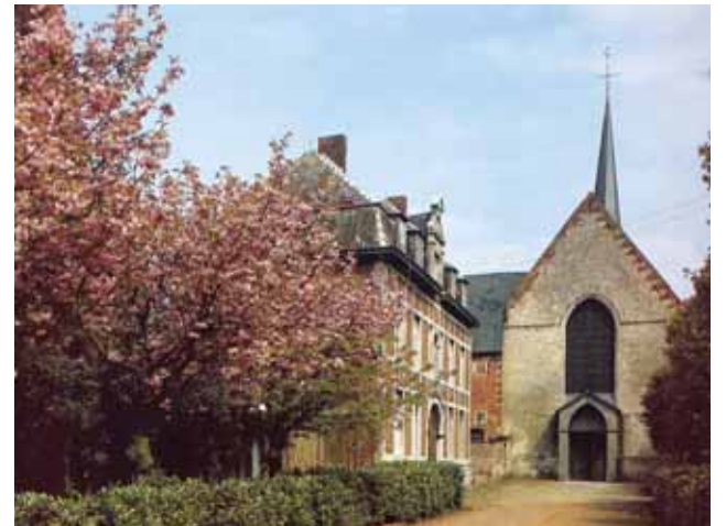
Premonstratensian Abbey, Chapel of the Holy Blood