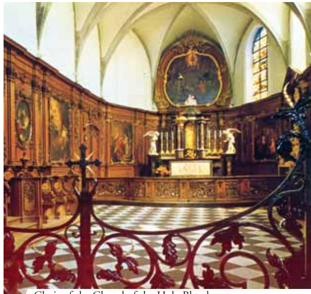
Choir of the Chapel of the Holy Blood

On January 13th, 1424, Pope Martin V approved the building of the Monastery of Bois-Seigneur-Isaac. Today the monastery is the goal of pilgrimages. The corporal stained with Blood is exposed to view in the chapel.