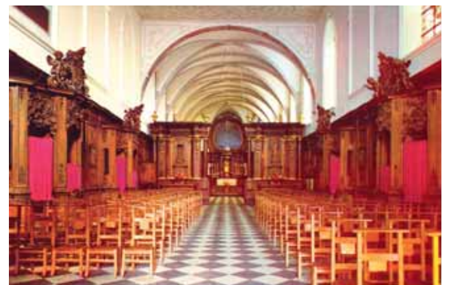
Interior of the Chapel of the Holy Blood