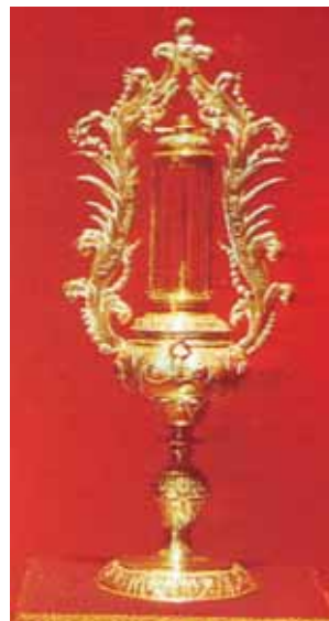
Reliquary of a Thorn from the Crown of Jesus