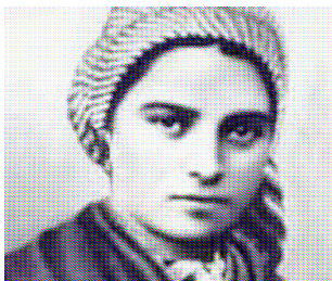
(1) St. Bernadette