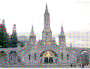
(5) The Shrine at Lourdes