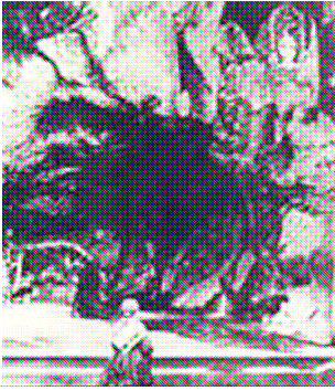
(3) One of the earliest photographs of Bernadette at the grotto (1864)