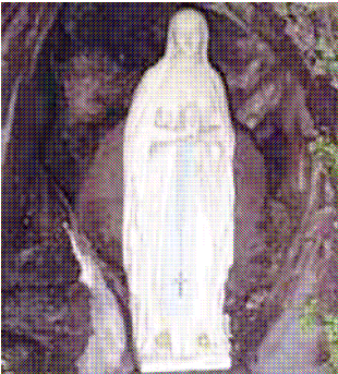
(4) Statue of the Virgin Mary in the grotto where she appeared to Bernadette