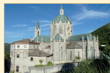
Shrine of Our Lady of Sorrows of Castelpetroso