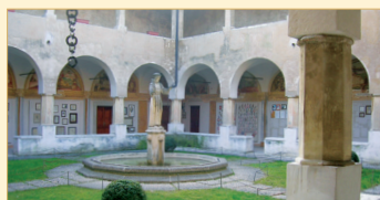
Cloister of the Shrine