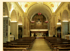
Inside of the Shrine