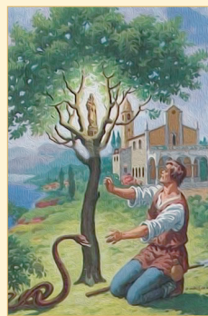
Painting that depicts the apparition