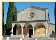
Outside of the Shrine