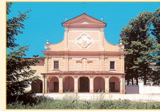
Shrine of the Blessed Mother of the Trompone