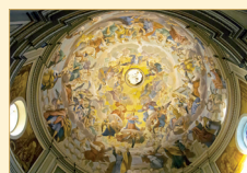
In the cupola dome the fresco representing the Coronation of the Virgin may be admired, they are attributed to the artist Gaudentio Ferrari