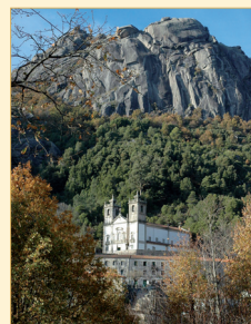
The Shrine of Nossa Senhora da Peneda is found among the mountains of the National Park of the same name, Peneda-Gerês, in northern Portugal. Before approaching the Shrine, a large block of granite is seen on its upper part, resembling a human head profile