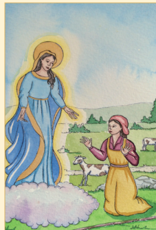
Depiction of the Apparition