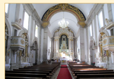
Interior of the Shrine