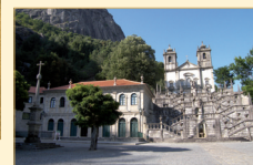
Shrine of Our Lady of Peneda, Arcos de Valdevez, Portugal and the emotionally evocative Staircase of the Virtues