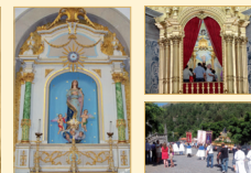
Procession in honor of Our Lady of Peneda