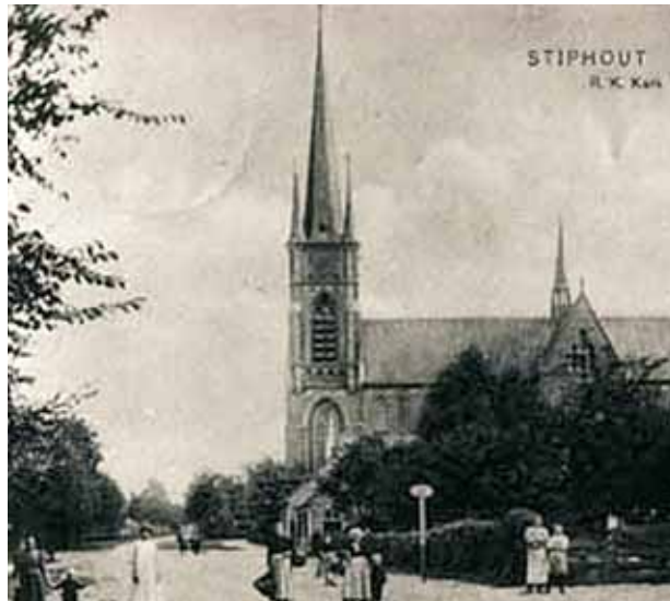
Saint Trudo's Church, Stiphout