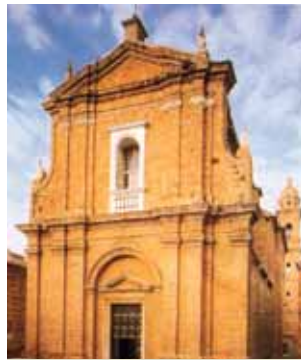
Church of Saint Bartholomew