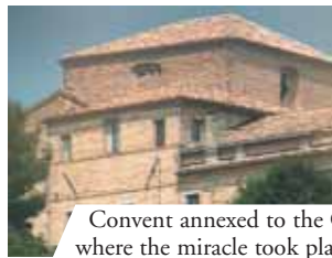
Convent annexed to the Church of Saint Francis, where the miracle took place