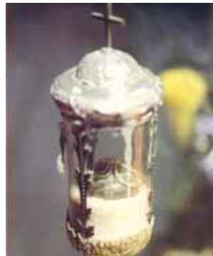
Reliquary of the miracle