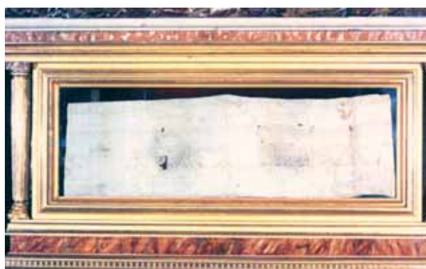
Relic of the Blood-Stained Corporal