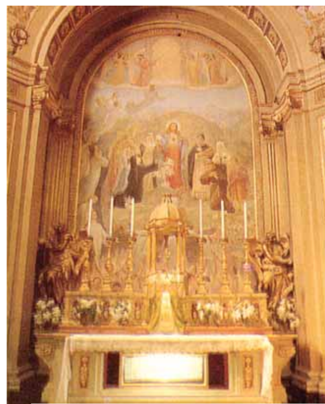
Chapel of the Most Blessed Sacrament where the relic is kept

In 1493 one of the first confraternities in honor of the Most Blessed Sacrament was instituted at Macerata (1494) and it was here that the pious practice of Forty Hours was established in 1556. Every year on the occasion of Corpus Christi, the corporal of the miracle is carried in procession behind the Most Blessed Sacrament.