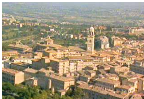
View of Macerata