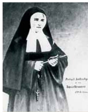
Saint Bernadette decided to embrace religious life and entered into the convent of the Sisters of Charity in Nevers