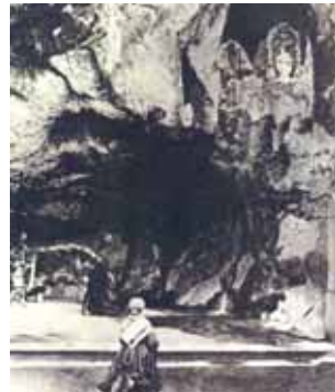
One of the oldest photos of Bernadette by the grotto in 1864