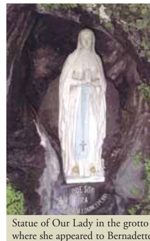
Statue of Our Lady in the grotto where she appeared to Bernadette