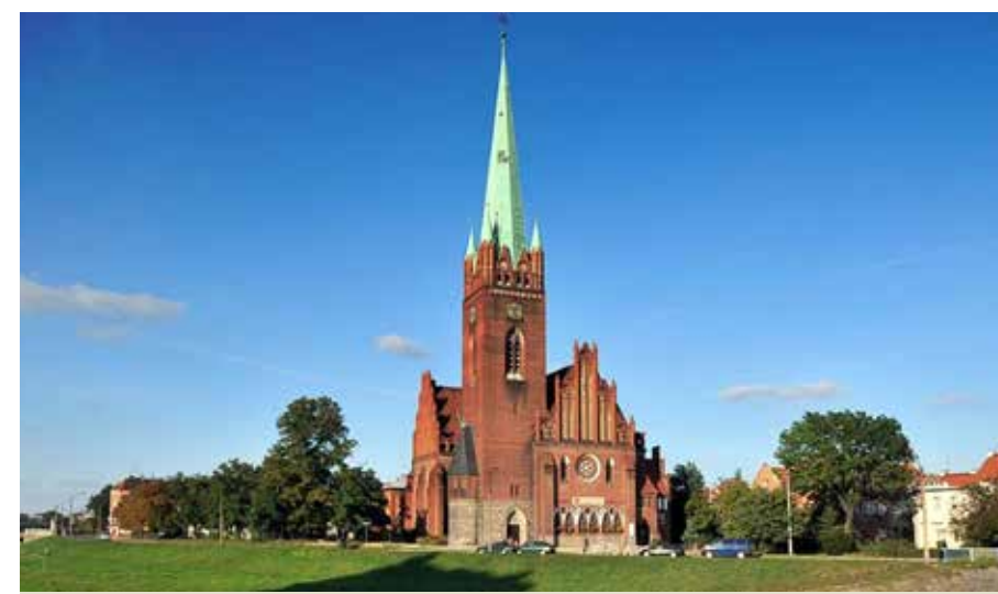
Facade of the Church where the miracle took place