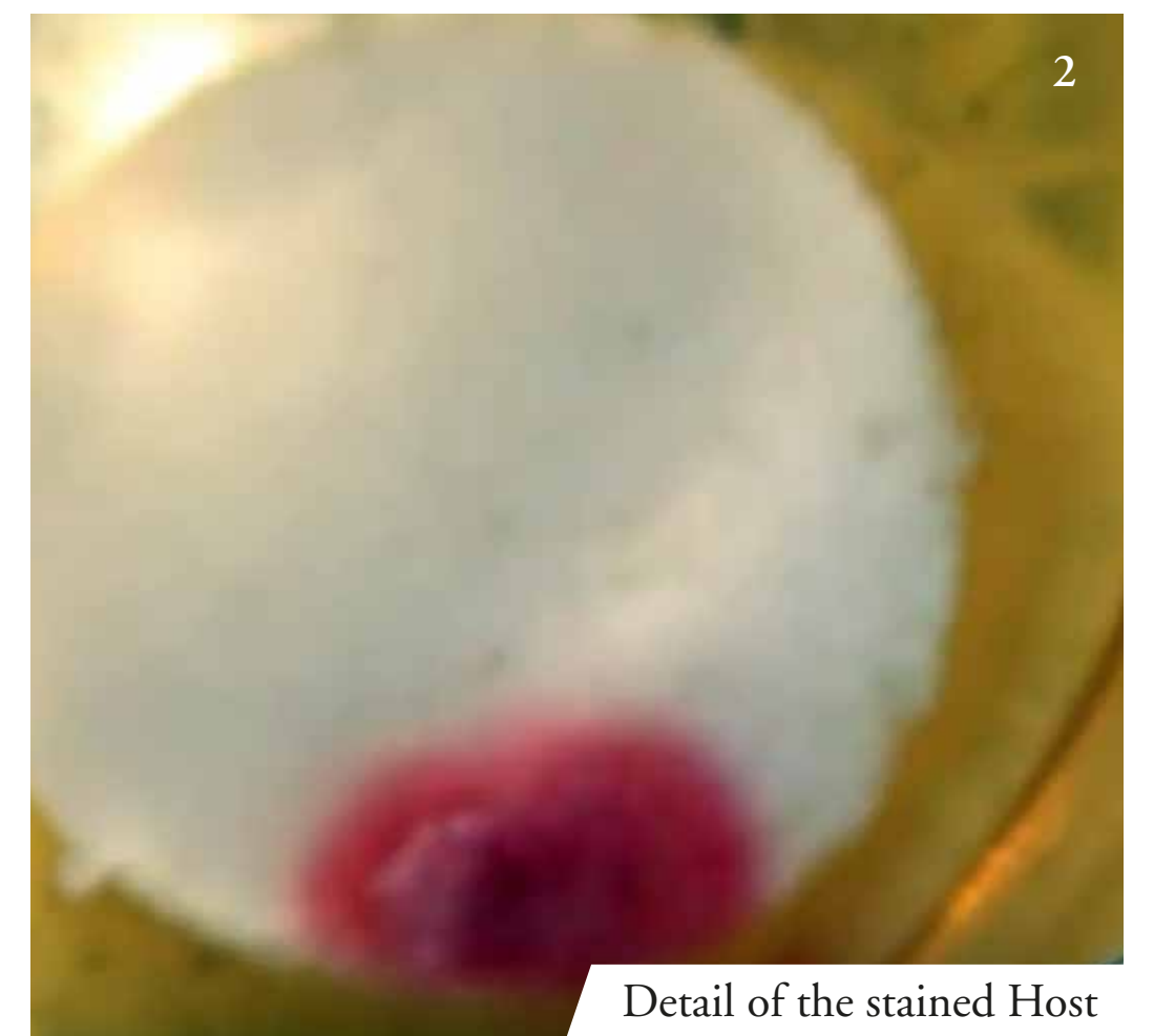
Detail of the stained Host