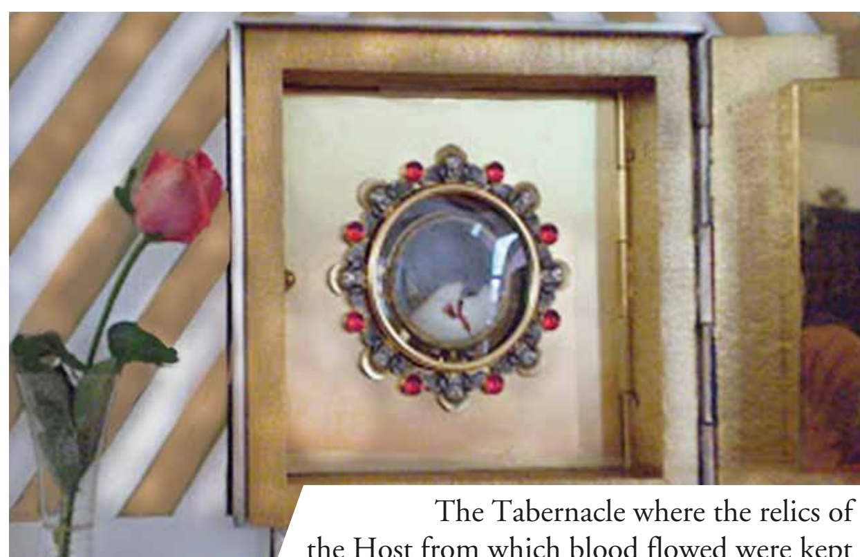
The Tabernacle where the relics of the Host from which blood flowed were kept