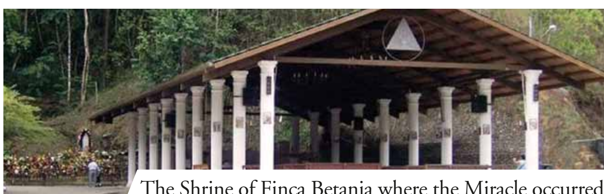
The Shrine of Finca Betania where the Miracle occurred