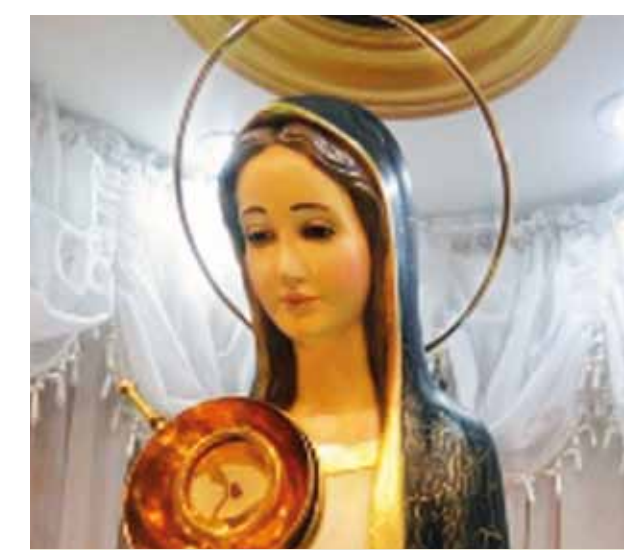
The new Tabernacle located in the chapel of Perpetual Adoration at the convent of the Augustinians Recollects of the Sacred Heart of Jesus in Los Teques, where the relics of the Eucharistic Miracle of Betania have been transferred.