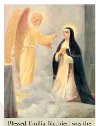
foundress of the Dominican Third Order Regular and always nurtured a great love for the Blessed Sacrament. One day while she was taking care of a fellow Sister who was very sick, she lost track of the time and so arrived at the end of the Holv Mass, thus missing Holy Communion. At that point, she began to express her regret to the Lord for not having been able to receive Him, and suddenly an angel miraculously appeared to her and gave her Holy Communion.