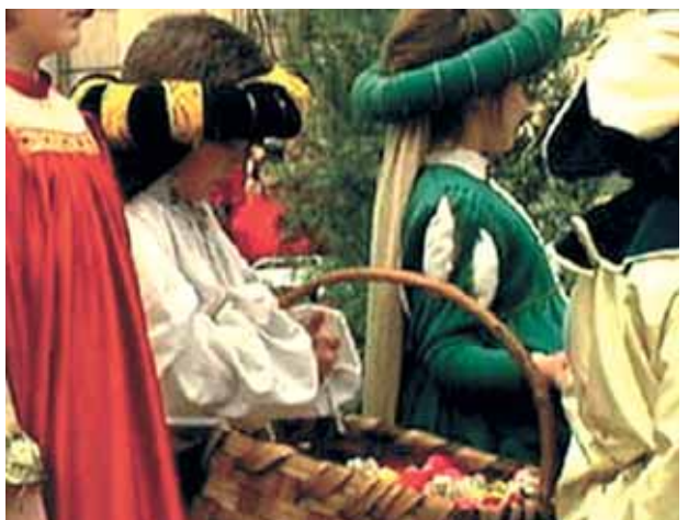
Procession in honor of the Holy Blood at Mantua