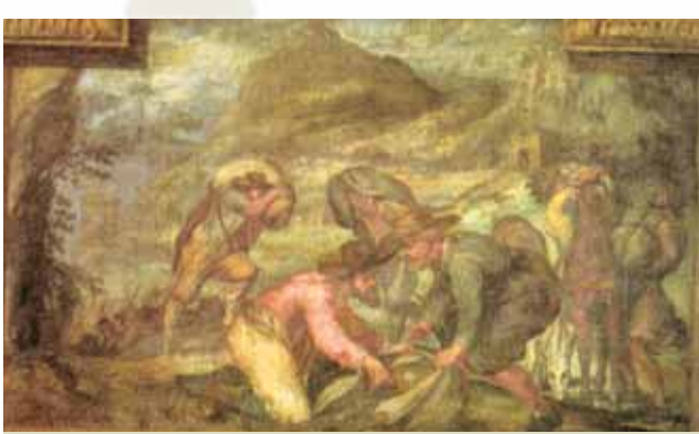
G.A. Recchi, frescoes that describe the miracle and that are at the

per non obbligare Dio a fare eterno miracolo col mantenere sempre incorrotte, come si mantennero, quelle stesse eucaristiche specie