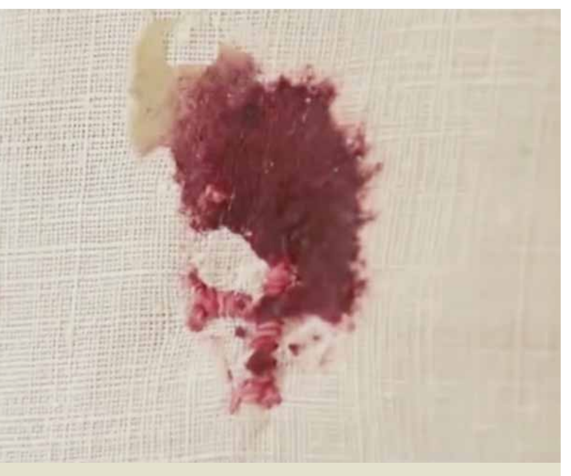
The two scientists have affirmed that it is not possible that someone had placed a fragment of a human body in the tabernacle since the fragments that made up the Host were tightly interconnected to the fibers of the human tissue, and penetrated each other, as if a fragment of "bread" suddenly transformed itself into "body".