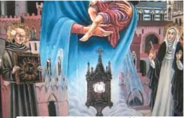
Detail of a painting depicting the Hosts of the miracle in Santa Maria in Provenzano