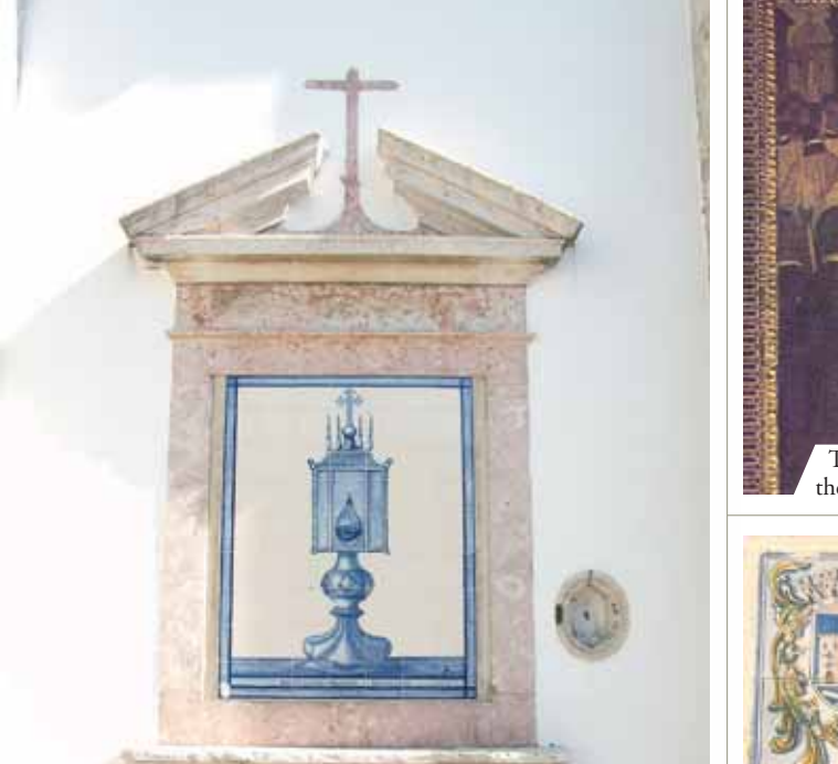
Pedro Crasbeeck, Print of 1612 that shows exactly the glass ampulla in which was miraculously found the Host of the miracle