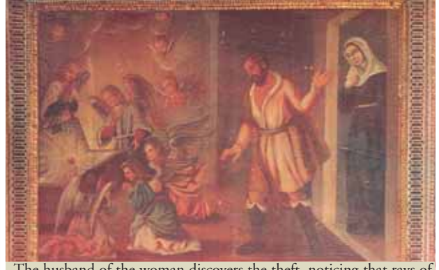
The husband of the woman discovers the theft, noticing that rays of light were emanating from the kitchen cupboard. He opened the cupboard and saw a Bloody Host which had changed into Flesh