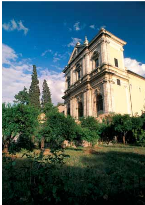
Church of St. Gregory the Great in Heaven, Rome