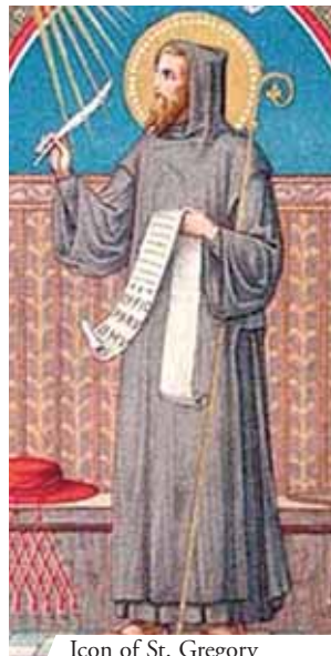
Icon of St. Gregory