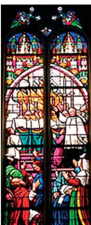
of St. Just at Pressac, above the main altar depicting the miracle