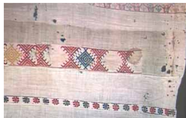
Detail of the Blood-stained linen