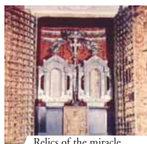
Relics of the miracle