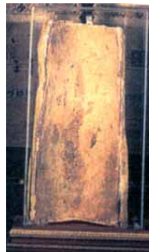
Oil jar where the miracle took place, Offida