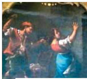
Frescoes in the church that illustrate the miracle