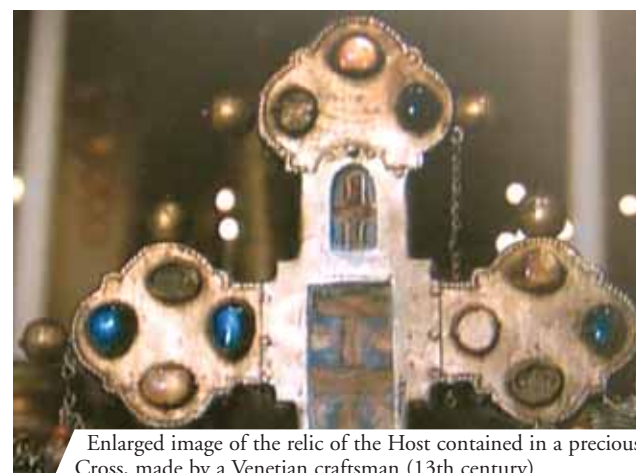
Enlarged image of the relic of the Host contained in a precious Cross, made by a Venetian craftsman (13th century)