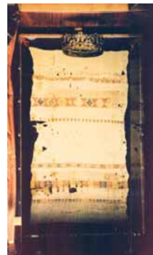
Relic of the linen with Blood spots where Richiarella enfolded the miraculous Host