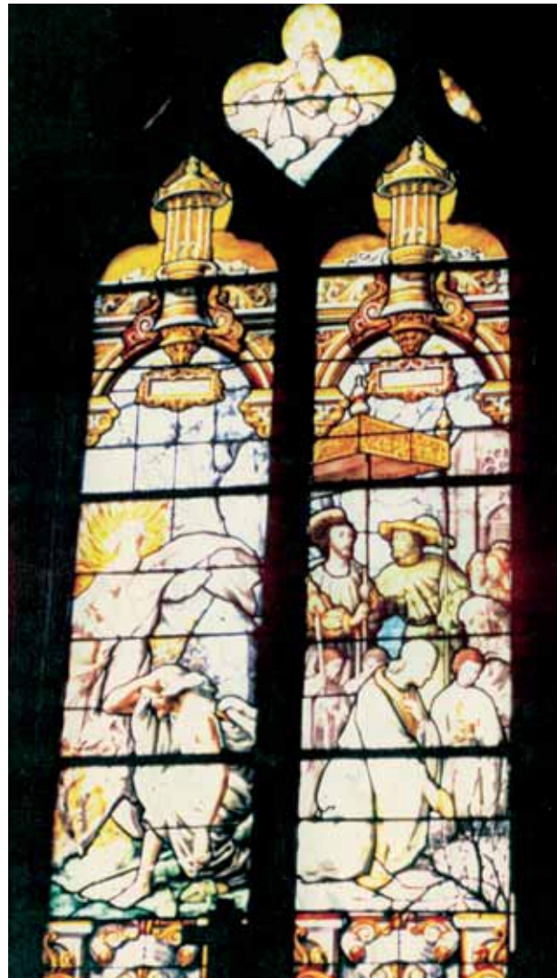
Window depicting the miracle

In 1533, some thieves stole a ciborium containing some consecrated Hosts from a church. The thieves then discarded the Hosts in a field. Unfortunately there was a strong snow storm; however, the following day the Hosts were recovered and miraculously were found to be in perfect condition. The numerous healings and the tremendous popular devotion that followed the miracle were not sufficient to protect the Hosts, which were destroyed by some seeking to profane them.