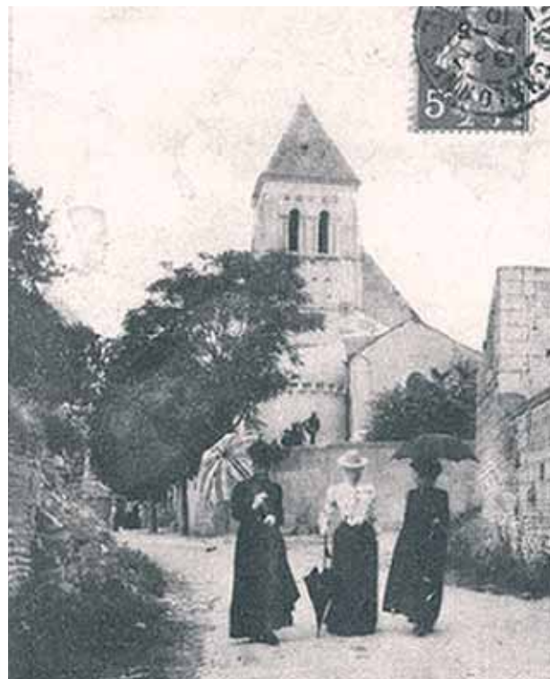
Parish church of Les Ulmes