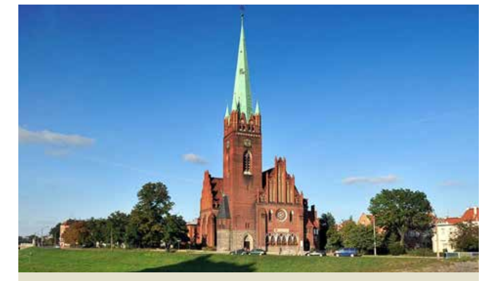
Facade of the Church where the miracle took place