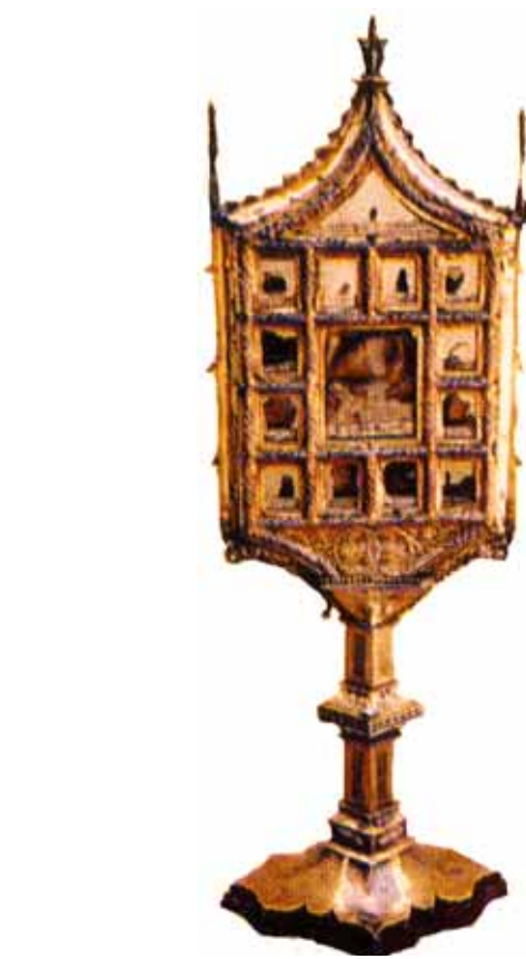
Monstrance containing the relics of the miracle