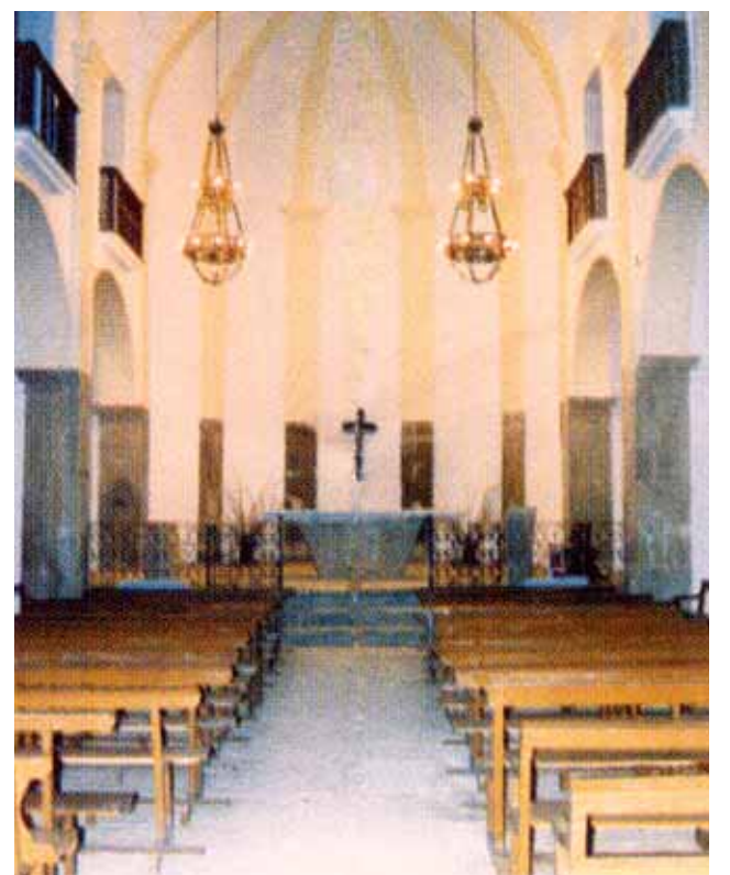
Inside the sanctuary