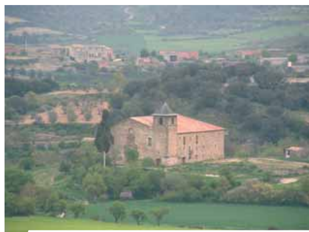
Sanctuary where the miracle occurred