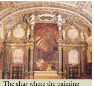
I he altar where the painting recounting the Sagrada Forma is kept