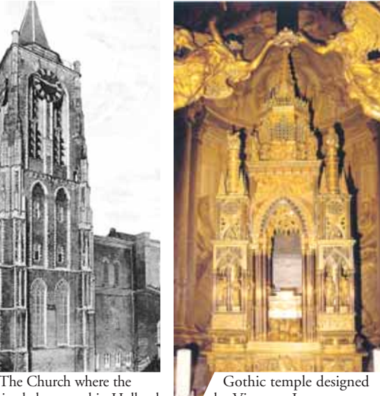
miracle happened in Holland wy by Vincente Lopez