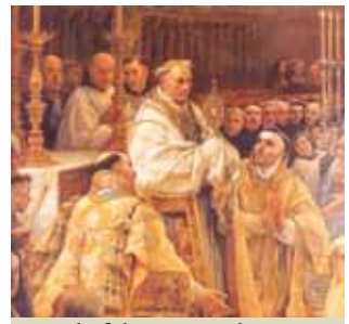
Detail of the painting by Claudio Coello