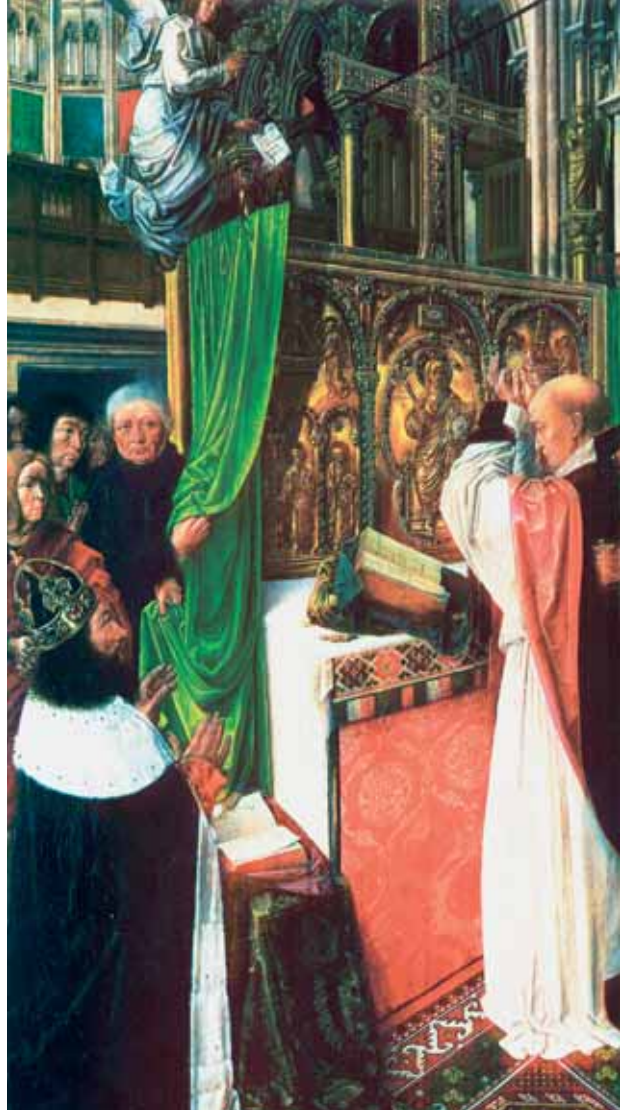
The Mass of St. Egidio in the presence of Charles Martel, National Gallery of London

famous that popular fervor often attributed it to Charlemagne, and not to Charles Martel, as if the real participant were not sufficiently