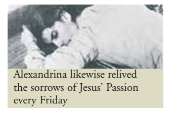
Alexandrina likewise relived the sorrows of Jesus' Passion every Friday

Alexandrina Maria was born in Balasar, Portugal on March 30, 1904. At age 14, in order to escape an attack by three men and to maintain her purity, she jumped from the window, but did not escape without suffering injury. The consequences were terrible, if not immediate. In fact, several years later, she became bedridden from a progressively increasing paralysis, from which she suffered for the remaining 30 years of her life. Yet, she did not despair, but entrusted herself to Jesus with these words: “As you are a prisoner in the tabernacle and I am a prisoner on my bed for doing Your will, so we can keep ourselves company”. As a result, she began to live through ever more powerful mystical experiences, and from Friday, October 3, 1938 until March 24, 1942, for up to 182 times, she relived the sufferings of the Passion. Beginning in 1942 until her death, Alexandrina was fed only by the Eucharist, and