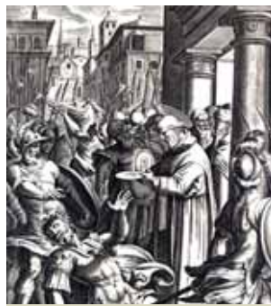
Antique image which shows the miracle