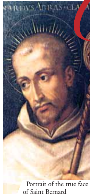
Portrait of the true face of Saint Bernard