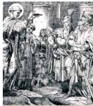
Saint Bernard converts the duke

One of the biographies of Saint Bernard recounts that the saint “came to Aquitania to reconcile to the Church the duke of this province – but since he refused such reconciliation, the saint of God went towards the altar to celebrate the Mass while the duke, having been excommunicated, waited for him outside the door of the church. After the consecration, Bernard placed the Host on the paten and exited the church, with his face aflame with sacred ire.