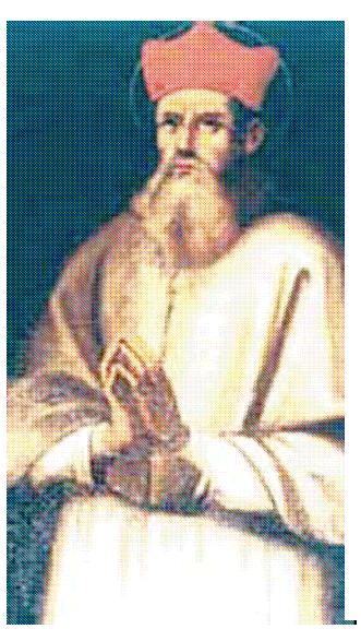
(2) St. Peter Damian