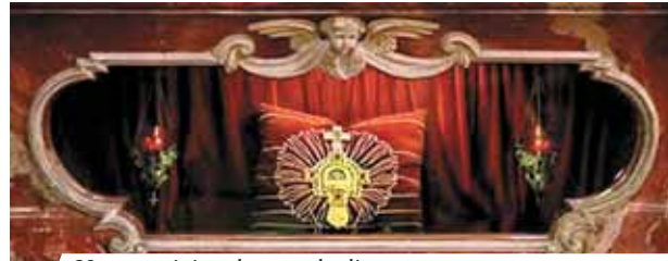
Urn containing the sacred relic

For more than 900 years it has been possible to venerate the relic of a portion of the Most Precious Blood of Jesus at the Benedictine Monastery at Weingarten. According to many historians, the soldier Longinus had carried the relic of the Most Precious Blood of Christ to Mantua. Later the Precious Blood was divided into several portions and given to various rulers of the era, the most famous of whom was Charlemagne, and to different popes.