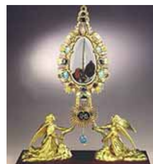
Relic of a Nail from the Cross, Kunsthistorisches Museum in Vienna