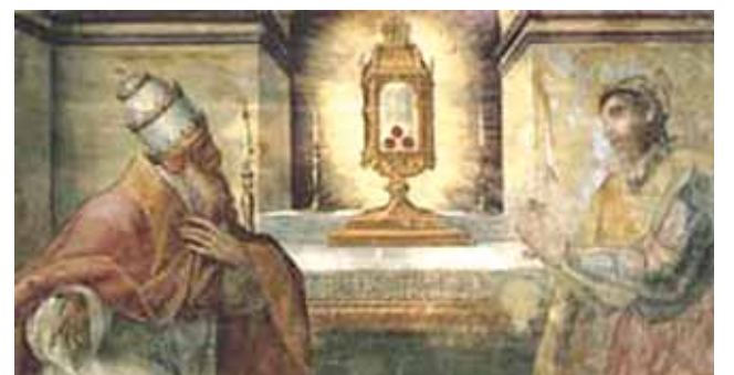
Pope Pius II venerates the precious relic

Every year a ceremony known as The Ride (or Procession) of the Blood, in honor of the relic, was organized at Weingarten. It was a parade in which nearly 3,000 horses, ridden by representatives of the individual parishes and by the clergy of the individual churches, participated.