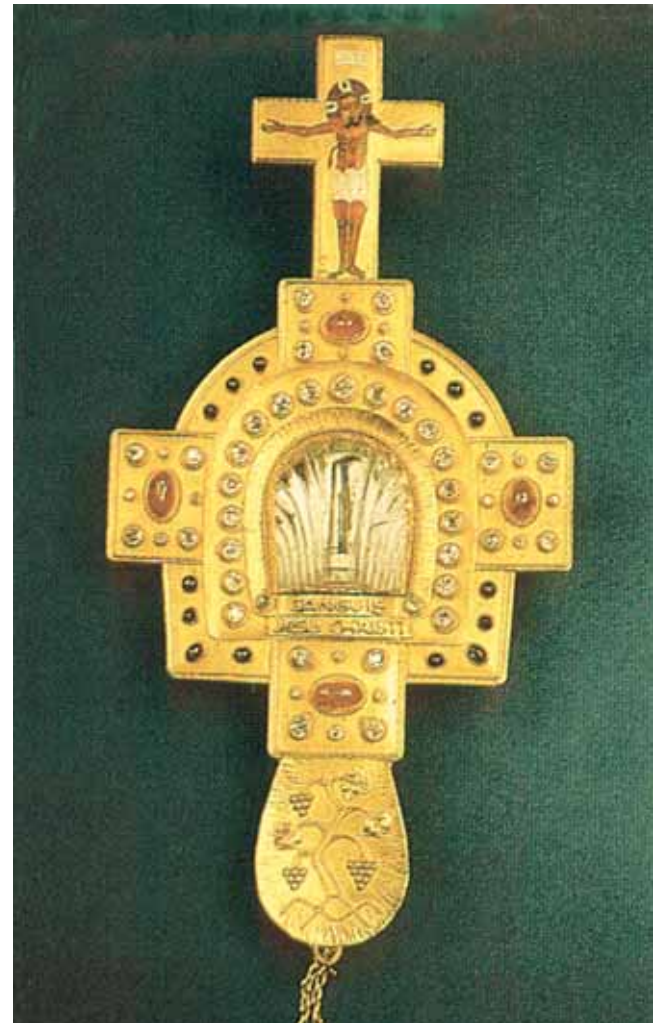
Relic of the Most Precious Blood