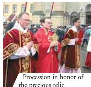
Procession in honor of the precious relic