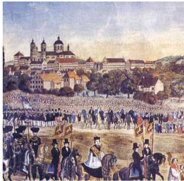
Antique painting depicting The Ride (or Procession) of the Most Precious Blood held in Weingarten