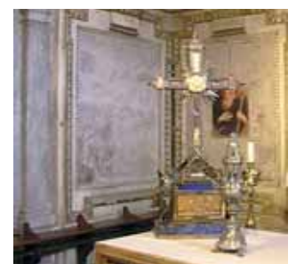
Relic of a fragment from the Holy Cross which is preserved in Rome in the Basilica of The Holy Cross in Jerusalem