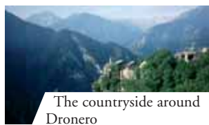
The countryside around Dronero