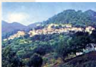
View of San Mauro la Bruca