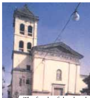
The façade of the church of San Mauro